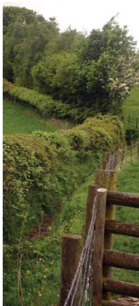
Fig 1. Examples of small-scale tree features, a hedgerow and shelterbelt at Pontbren, embedded in the agricultural landscape.