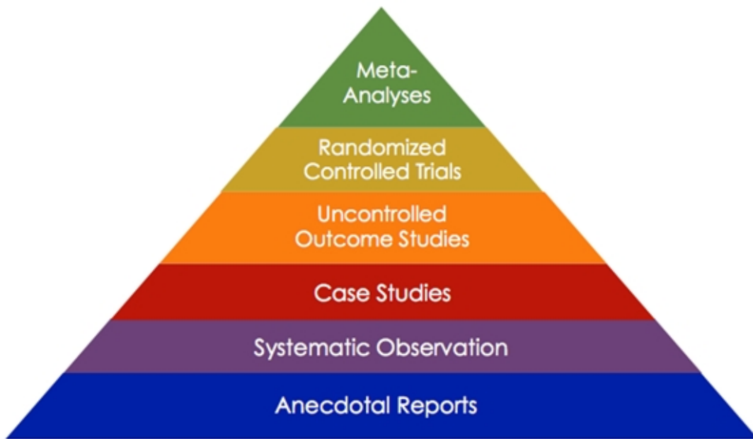
FIGURE 1: The hierarchy of evidence