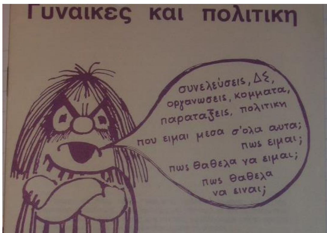
Image 1: The caption reads “assemblies, administrative councils, organisations, Parties, politics. Where and how do I position myself in relation to all these? How would I like to be? How would I like all these to be?” 119