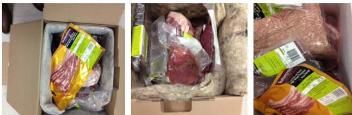
Figure 1. Sample boxes with meat (left-right: Wool lined, Wool unlined, expanded polystyrene boxes).

Three cardboard boxes were prepared: one containing lined Wool (WC), one unlined Wool (WCUN) and one EPS. A 10 kg variety of fresh meat (Lamb joints) were packed into each box (Figure 1), a variety of meat was stored at room temperature for 72 h. The boxes were then opened, and swabs taken from the top, middle and bottom surface of each box and from the condensed liquid found on the surface of meat packs. Samples were also taken from the lamb shoulder joint from each box. They were then analyzed for microbiological contamination as described below.