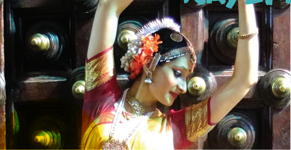
PHOTOGRAPHY / FOTOGRAFFIAETH SELVARTNAM