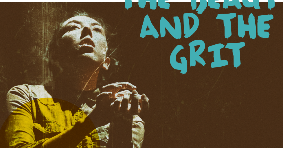
PHOTOGRAPHY / FOTOGRAFFIAETH ROY CAMPBELL-MOORE

SUNDAY 28 / DYDD SUL 28, ALL DAY / DRWYR DYDD