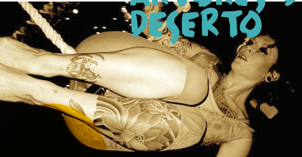
PHOTOGRAPHY / FOTOGRAFFIAETH STILL FROM VISUAL INFLUENCE FILM