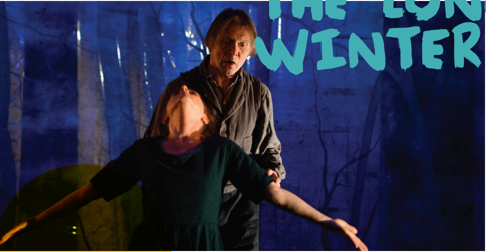
PHOTOGRAPHY / FOTOGRAFFAETH DAVE HEFEE - PHOTO FROM ONCE UPON A TIME IN THE DARK, DARK WOOD