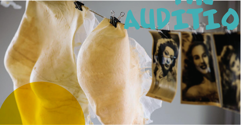
PHOTOGRAPHY / FOTOGRAFFIAETH WARBEN ORCHARD PHOTOGRAPHY