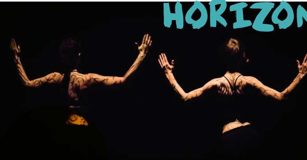
PHOTOGRAPHY / FOTOGRAFFIAETH MGS3APA, ABD EL ATI