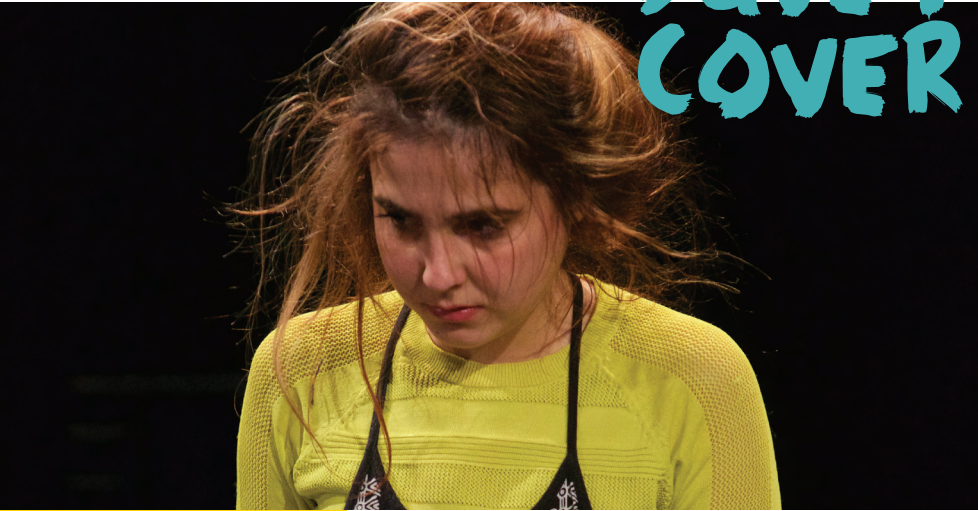
FROM PRODUCTION: HARBDRACH YN Y GEEK / IOR CONYRCHAD HARBDRACH YN Y GEEK