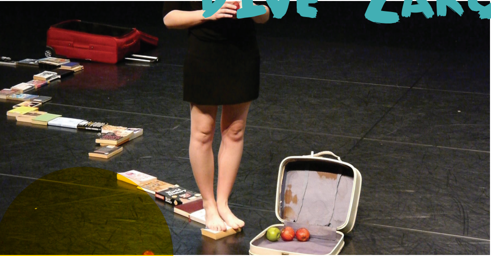
PHOTOGRAPHY / FOTOGRAFFIAETH IWAŁ BRÓC