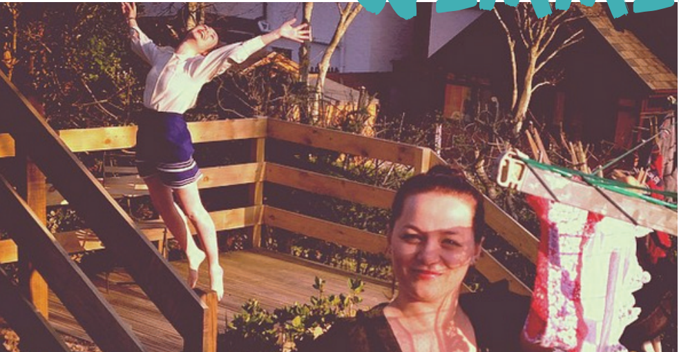
PHOTOGRAPHY / FOTOGRAFFIAETH JOSEPH MITCHELL