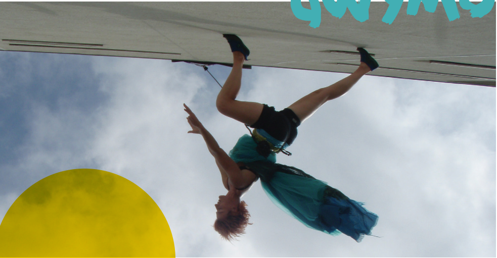
PHOTOGRAPHY / FOTOGRAFFIAETH KATE LAWRENCE