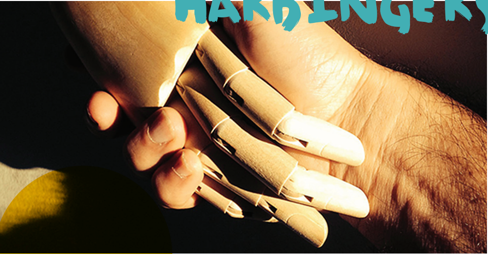
PHOTOGRAPHY / FOTOGRAFFIETH FRANCES NEWMAN

SATURDAY 27 / DYDD SĀDWRN 27, 17.15 & 19.30