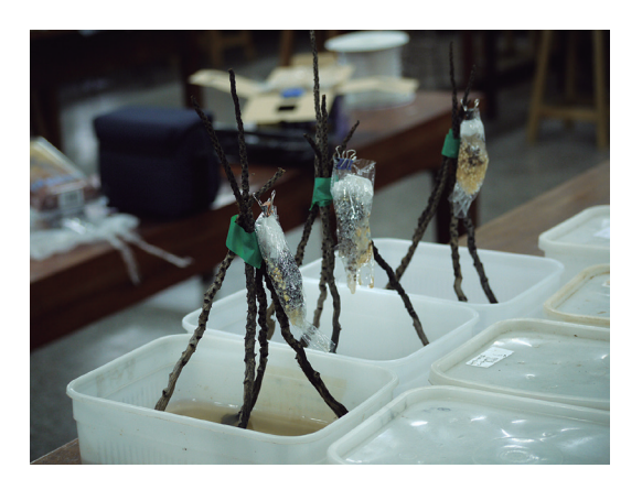
Figure 1. Three Phyllomedusa trinitatis nests with complete clutches transferred to clingfilm covers and suspended above water.

In order to follow the process of hatching and emergence in complete clutches, leaves were carefully removed either partially or completely from nests at different stages of development. When leaves were very firmly stuck to the clutch, complete removal would damage some eggs, so some leaf area was retained. Each clutch was then wrapped in clingfilm with the top and bottom remaining open. A plug of damp tissue was placed on the top jelly plug to prevent complete closure of the clingfilm. Each wrapped nest was suspended by means of a clip from a tripod of sticks above a tub of dechlorinated tap water (Figure 1). Initially, we attempted to follow hatching and emergence by time lapse filming. However, picture resolution was poor and it proved preferable simply to watch nests around the time of hatching.