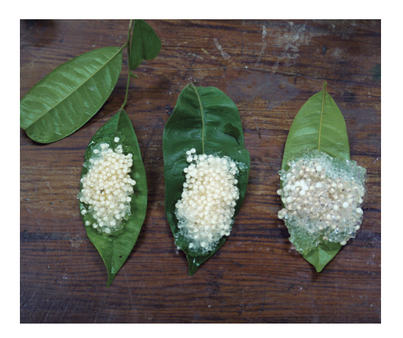
Figure 2. Three Phyllomedusa trinitatis nests with part of leaf covering removed, to show variation in clutch size and jelly plugs.

All nests had top and bottom jelly plugs, and clear eggless capsules scattered amongst the creamy-white eggs: there were no obvious accumulations of capsules close to the leaf surface. Mean (N = 5; \pm SD) nest components were: total wet mass (g) 19.4 \pm 2.5 ; top plug 2.5 \pm 1.1; bottom plug 3.5 \pm 0.6; eggs 8.2 \pm 1.8; eggless capsules 4.5 \pm 1.0 . Component proportions were quite consistent across this sample, with bottom plugs heavier than top plugs in all but one case. In the larger sample transferred to clingfilm parcels, we noticed more variability, especially in the bottom plugs, sometimes small with eggs close to the base of the nest (Figure 2). Dried samples of jelly plugs and yolkless capsules contained 3-4% dry matter i.e. are 96-97% water in the fresh state. The number of eggs per clutch ranged from 109–629 (mean 395.6 \pm 130.7 SD, N = 23).