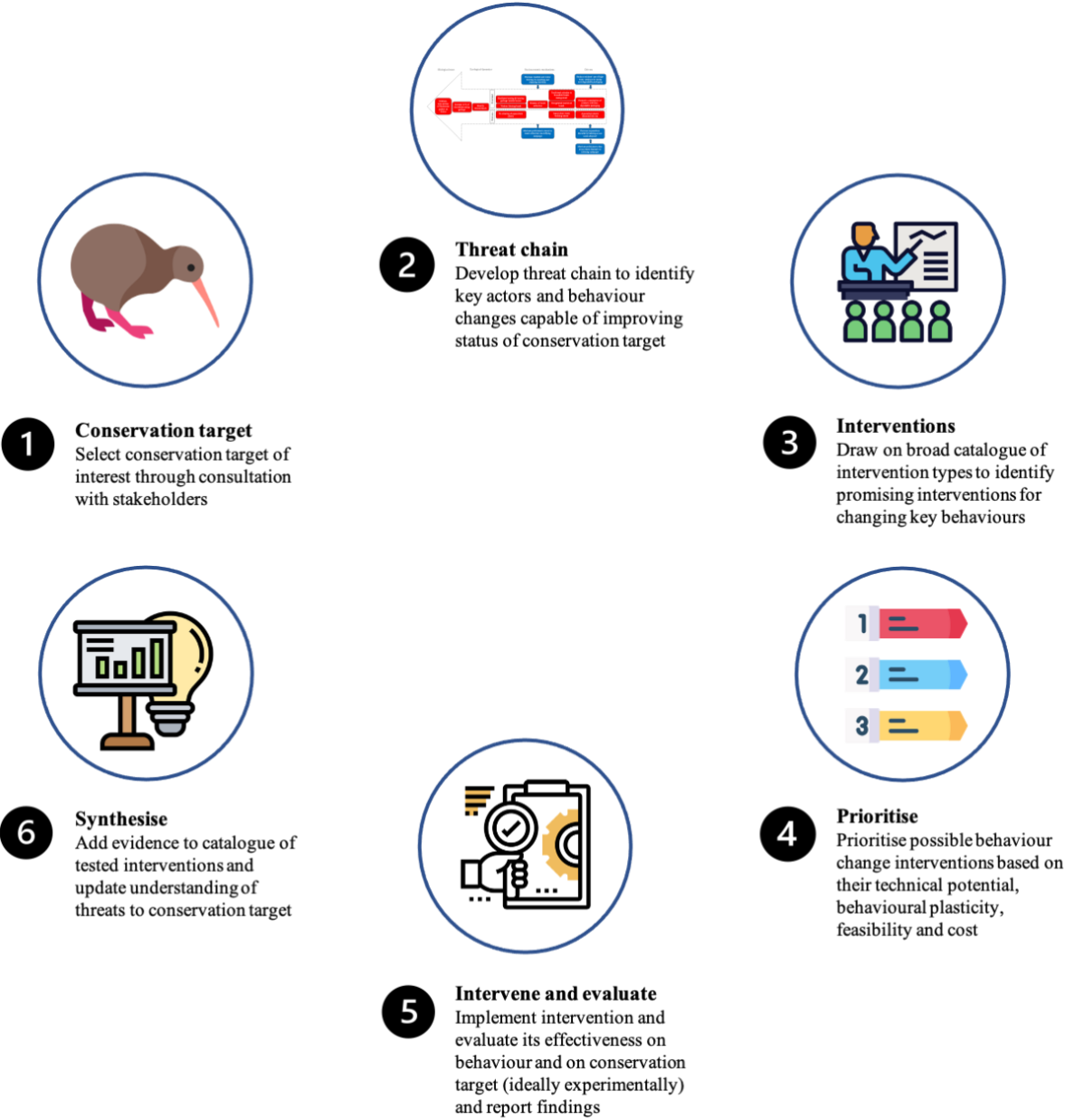
Fig. 1. Conceptual framework depicting the proposed six phases of selecting, implementing, and evaluating behaviour change interventions for biodiversity conservation.