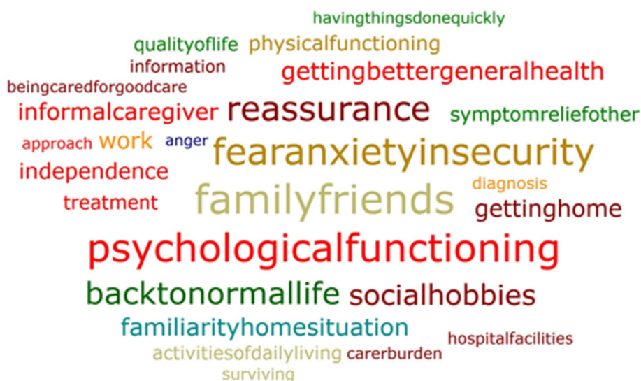
Fig. 3 Word cloud of 'Why does this matters most'

More than half of all patients (51.9%) felt their treating doctor did not know what mattered to them most. Of