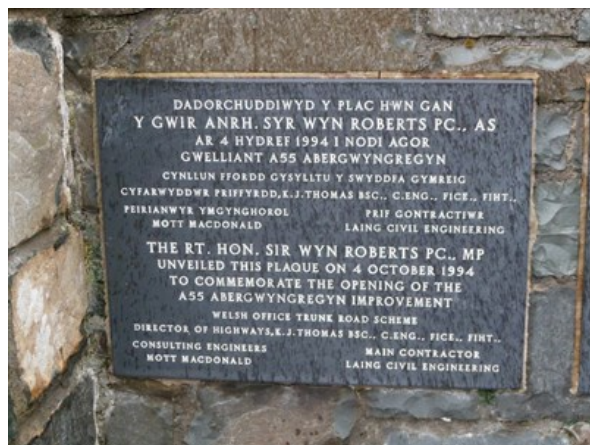
Figure 13: A55 Improvement Scheme plaque for Abergwyngregyn. 740

David Jones MP remarked that, every 3-4 miles along the A55 that you would pass a plaque with Wyn Roberts name on it. 739