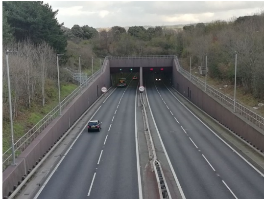
Figure 15: Photo of the western entrance of the Conwy Tunnel. 821

The bypassing of Conwy River by the time of its inception was not necessarily an innovation. A plan existed for such a bypass as far back as 1955. 822 The plan for a tunnel itself was finally announced after some ten years of debate over how exactly to bypass the river and solve the decades long issue of the traffic through Conwy. The secretary of state at the time Nicholas Crickhowell, on 28 July 1980, made the announcement of a tunnel under the Conwy River. 823