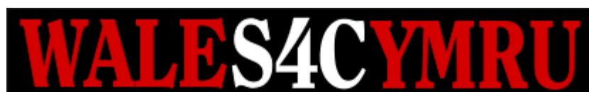
Figure 11: Original logo of S4C from 1982 till 1987.

Wales. 501 The amendment was to have Welsh Language broadcasting split between two existing channels BBC and ITV. Wyn Roberts is shown to not be a supporter of the amended plan; it was such duality that in part prompted the downfall of TWW due to bilingual issues within Wales. Such duality could only serve to poke the Red Dragon within Wales, at the expense of the Blue Dragon, and that it did. It was this amended plan that prompted the response of Gwynfor Evans, also a coup de grace to the plans of Willie Whitelaw, who after the landslide election reneged the Welsh Fourth Channel plan in favour of having Welsh language TV split between existing channels. These issues over the Welsh language and of Welsh TV went on into the 1980s with the advent of the Thatcher government. It was an issue that upset many in Wales since members of the populace had been wanting a channel for over a decade, since the collapse of TWW Wales had little in the way of Welsh language television.