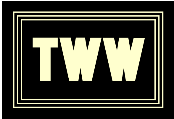
Figure 8: Television Wales and West logo.

Finally, Wyn Roberts aided in a series in conjunction with another media personality John Betjeman titled, Wales and the West , airing for 12 episodes between 1962-3 exploring the relationship between Wales and towns in the west of England. Though Wyn Roberts would have little to do with this series compared to previous programmes, it did echo a problem that he would have to deal with at the end of TWW. This leads to the second cultural issue that aided in the formation of Wyn Roberts' cultural thought, faced during the era of 1955-1969 whilst at TWW, it was the problem of catering for two different cultures and languages.