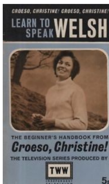
Figure 7: Croeso Christine accompaniment beginner's handbook. (Cardiff, 1967) 296