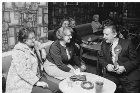
Figure 4: Wyn Roberts in 1974, talking to constituents.