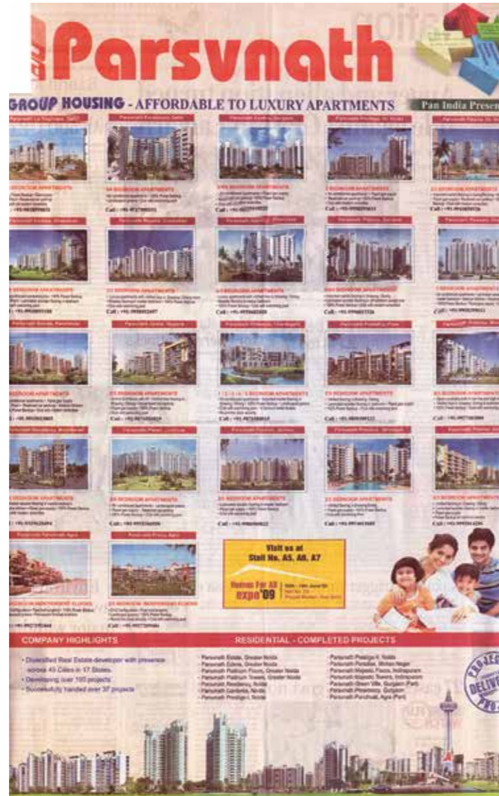
Advertisement for one of India's leading real estate developers in the Hindustan Times

Specifically in relation to land law, there is little in the way of actual planning law, and when there is, it is planned with a certain group of elites in mind. The majority of those who live in Bangalore cannot afford to buy cars or motorcycles, and yet there are apparently 1,000 vehicles added to the road every day in the city. These are the upwardly mobile Bangalorians who work within IT and are making the most of the burgeoning city and it being known as the “Singapore of the South.” Huge land acquisitions are undertaken in order to build in the name of the swelling bourgeoisie. Land acquisition is a common law inheritance and is known in India as “eminent domain.” It exists as a stop valve for the state to acquire land for “public purposes,” without the permission of those who already live on the land and have rights and attachments to the land. Those who are moved aside are, by and large, the architects of law from below, the slum-dwellers and impoverished who have little or no legal rights to the land on which they reside. A complex web of common law legacy gives way to a situation whereby land is acquired and new building schemes begin, whilst at the same time architects