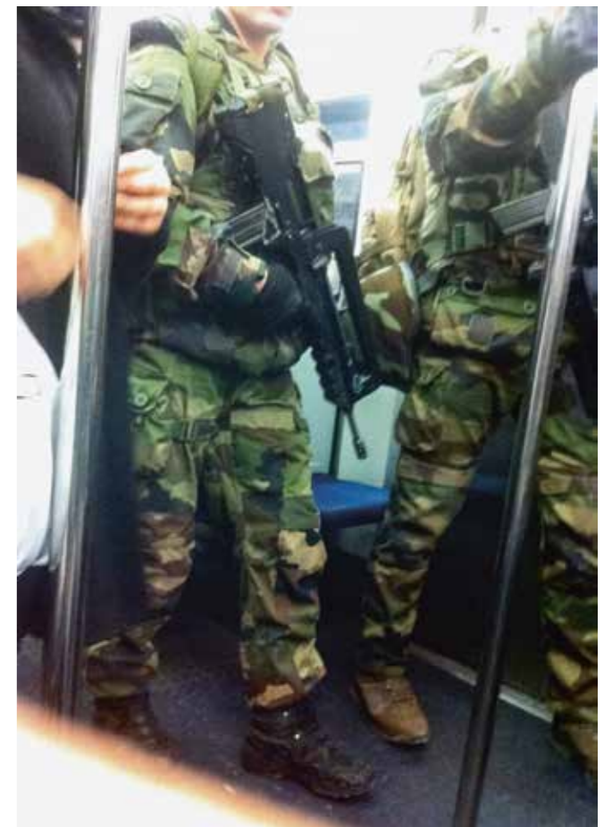
The Militarized City II: Soldiers in the Paris subway following the November 2015 terrorist attacks

Funnily enough, both examples in Brighton result from a piece of planning legislation that confirms the congenital relationship between individual property and capital within architecture, at the behest of variants of democracy that we relinquish to planning regulations to promote. Section 106 of the Town and Country Planning Act 1990 allows property developers to entice cash-strapped councils with propositions for new roads and facilities, so long as the developers can have their way—that is, so long as they can reappropriate public space and have their planning applications pushed through. High-yield land in central locations such as Brighton and especially London is mutating, transforming from its former nature as swaths of