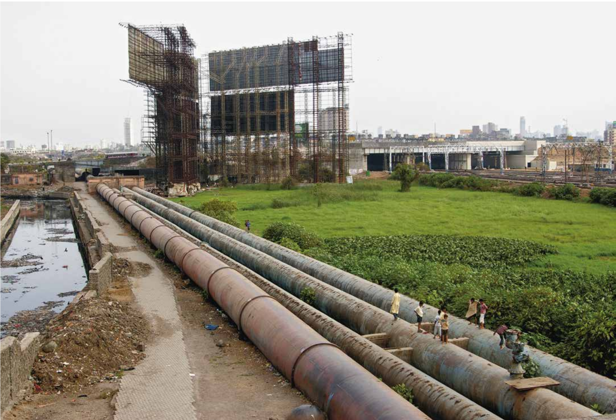
Slums developing around pipe lines that provide Mumbai with water