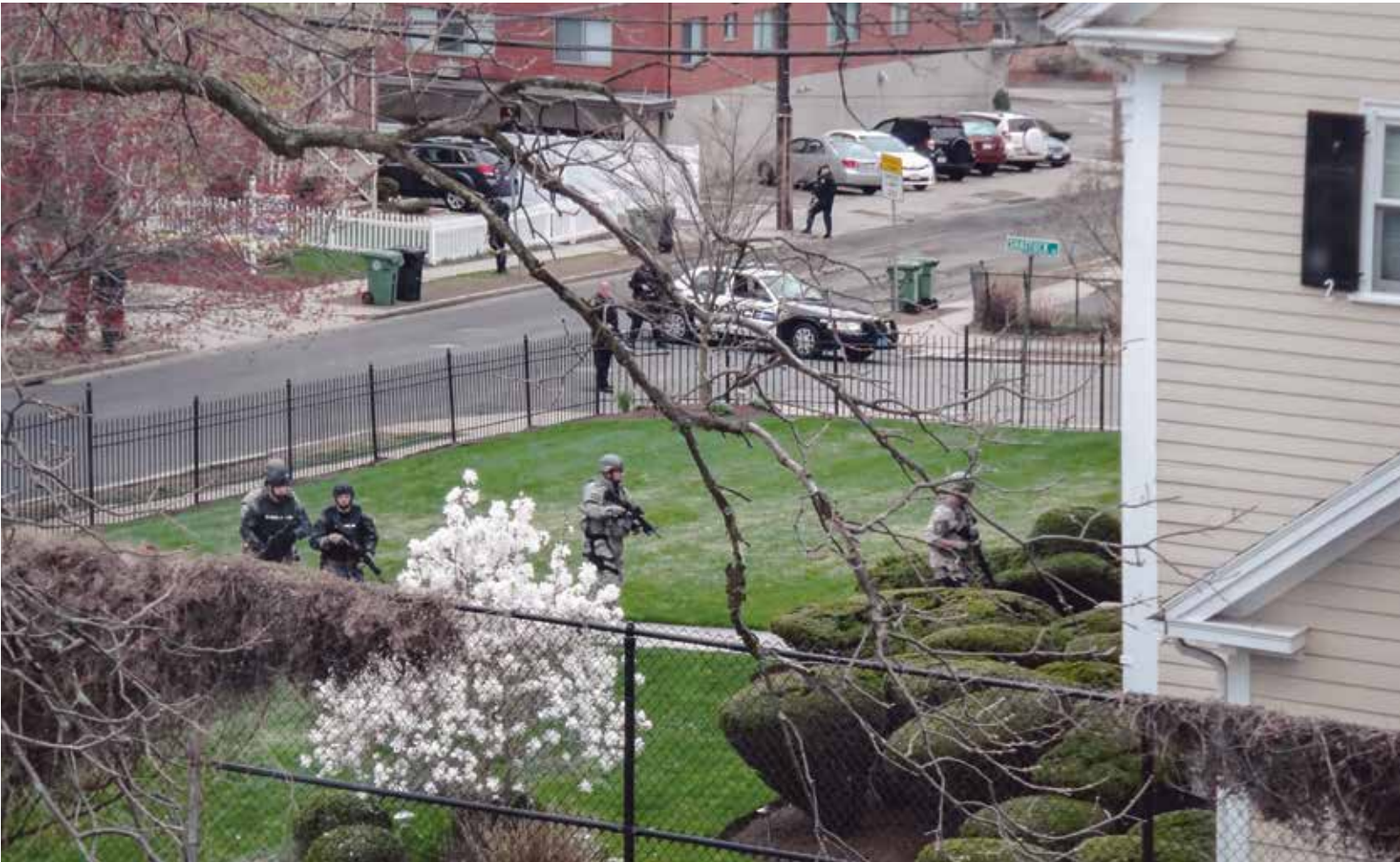
The Militarized City I: Manhunt in the city of Watertown, MA, on April 19, 2013, four days after Boston Marathon bombing