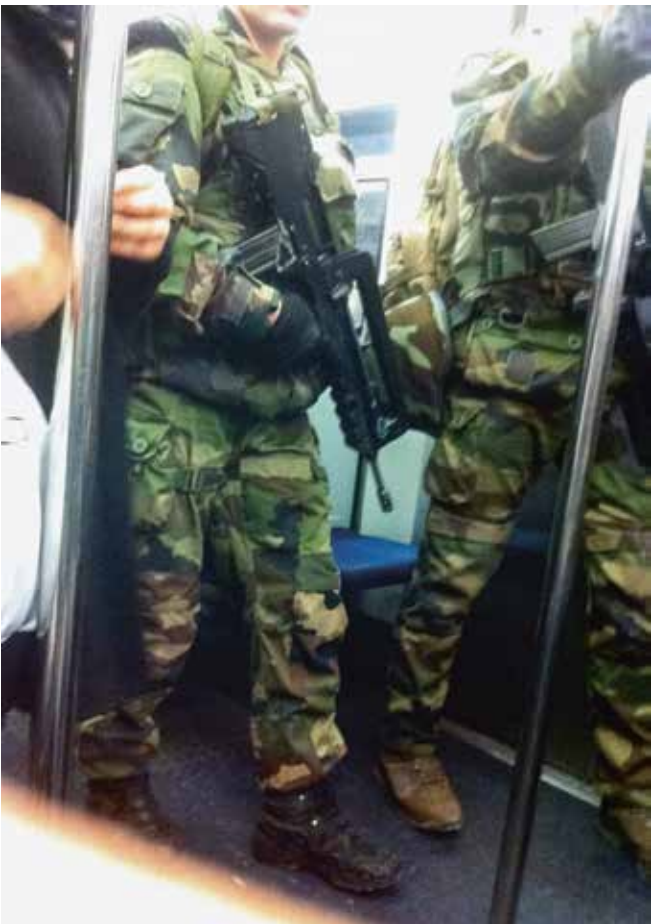
The Militarized City II: Soldiers in the Paris subway following the November 2015 terrorist attacks

Funnily enough, both examples in Brighton result from a piece of planning legislation that confirms the congenital relationship between individual property and capital within architecture, at the behest of variants of democracy that we relinquish to planning regulations to promote. Section 106 of the Town and Country Planning Act 1990 allows property developers to entice cash-strapped councils with propositions for new roads and facilities, so long as they can reappropriate public space and have their planning applications pushed through. High-yield land in central locations such as Brighton and especially London is mutating, transforming from its former nature as swaths of