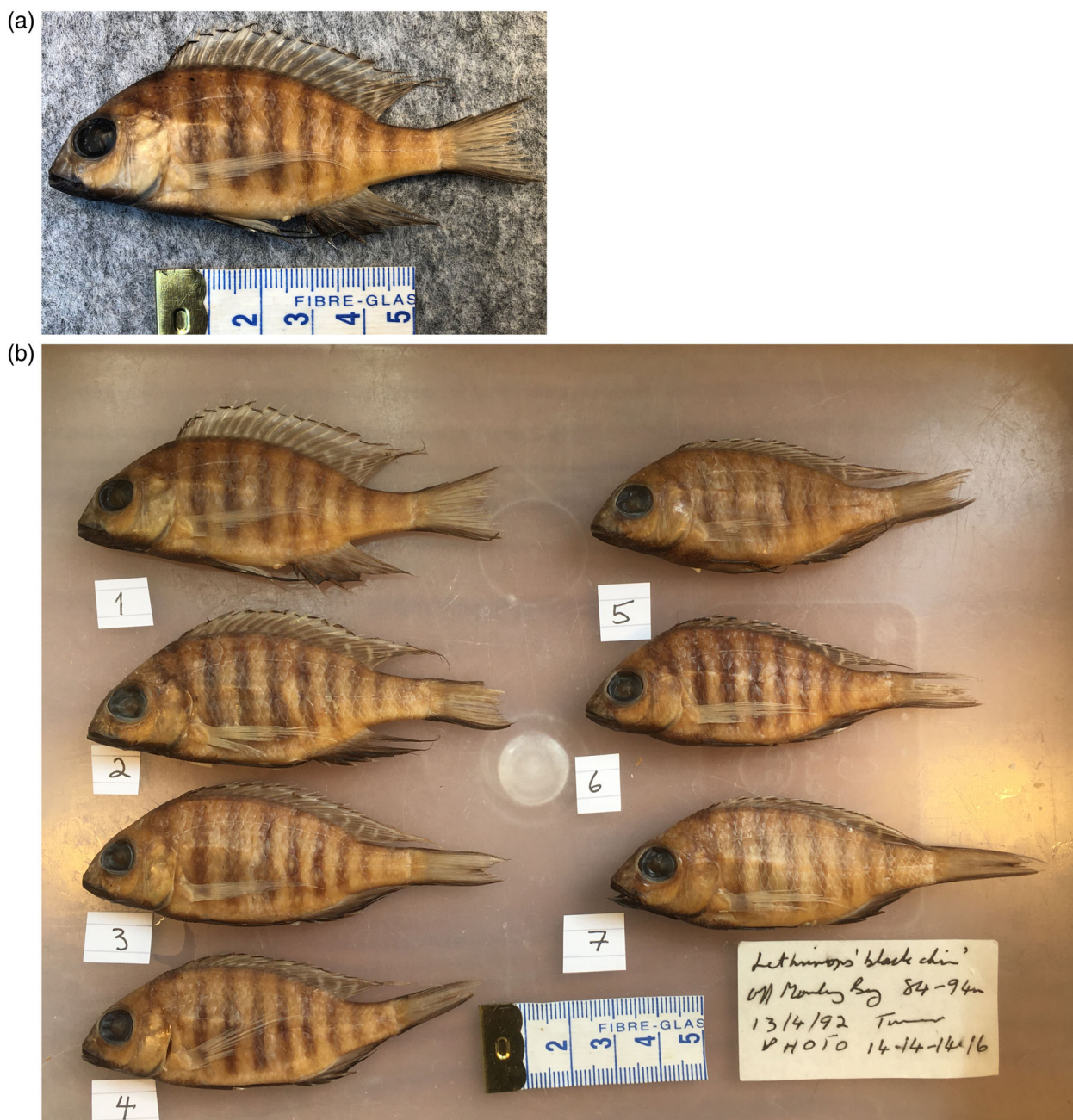
FIGURE 1 Lethrinops atrilabris sp. nov. Above: holotype: BMNH April 20, 2022.1, male, 72 mm SL (standard length), collected from trawl catch NE of Monkey Bay, at a reported depth of 84–94 m, 13 April 1992; Below: the full type series, holotype labelled 1, collecting information as holotype

transition into a cycloid state. Scales on chest are relatively large, gradually transitioning in size from larger flank scales, as is typical in non-mbuna Malawian endemic haplochromines (Eccles & Trewavas, 1989). A few small scales scattered on the proximal part of caudal fin.