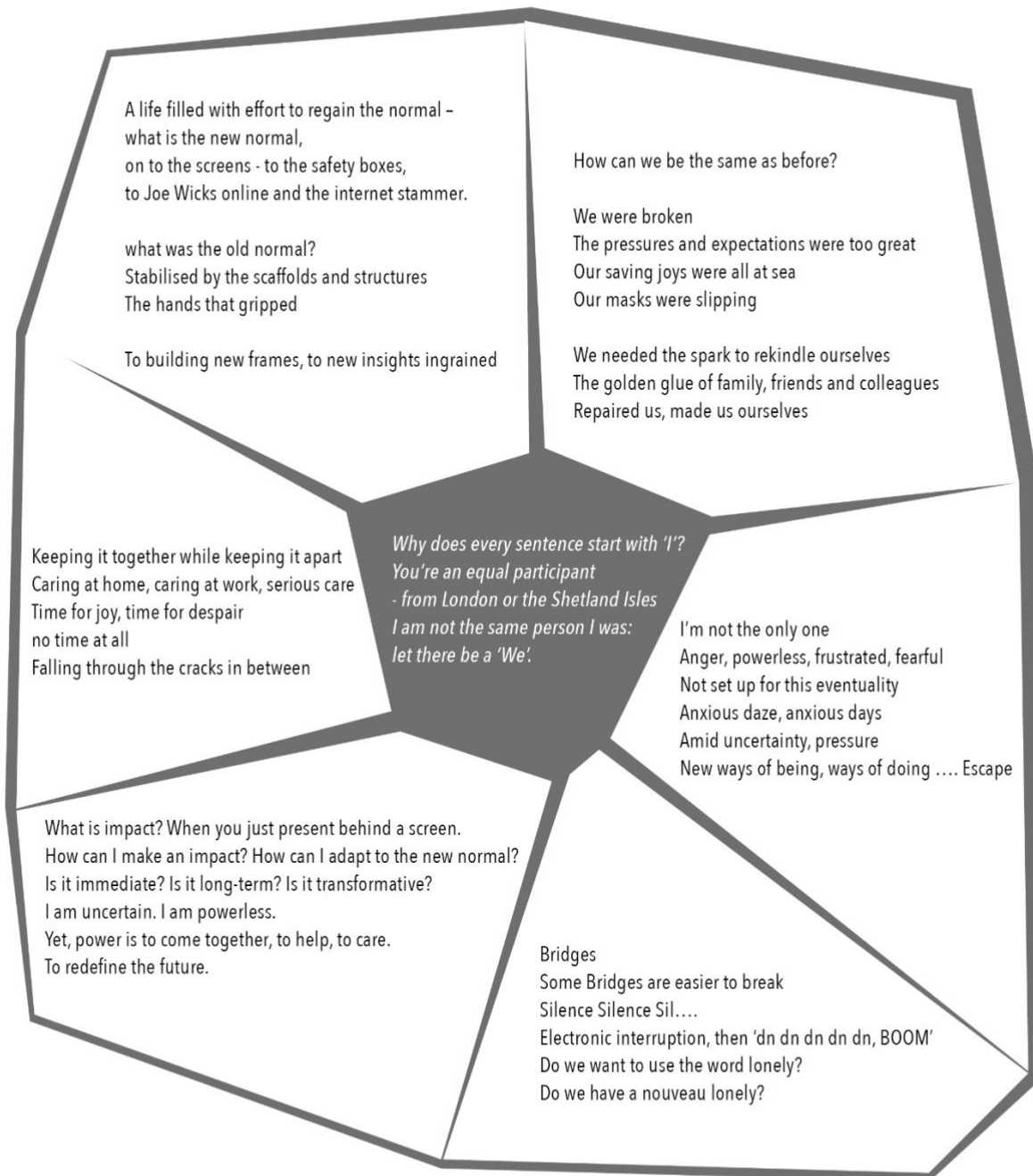
Figure 2: The Web of Words: Let there be a 'We'

read the chorus, choose a segment, then read, return, repeat