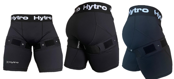
Fig. 1. Garment-integrated BFR with Velcro mechanism.

We initially measured the pressure exerted (mmHg) by the integrated BFR strap at each level. We collected these data, and subsequent efficacy outcome data for the dominant limb only, defined as the limb that participants would use to kick a ball (Neal et al., 2018). In an incremental order and beginning with the lowest level, external strap pressure was recorded by placing an air bladder between the garment and the lateral aspect of a