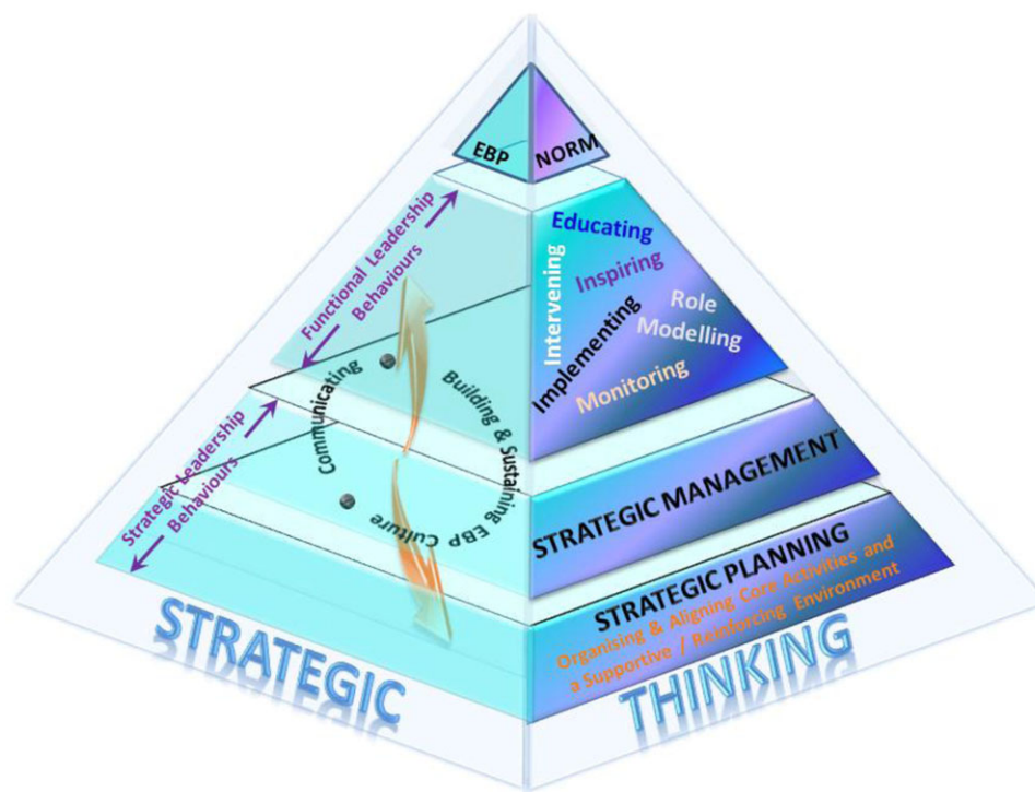
Figure 1. L-EBP, leadership behaviors supportive of EBP institutionalization.

multiplicity of leader behaviors required; and the critical, continuous, and overarching role of Strategic thinking. The framework highlights our observation that during Strategic-focused planning-organizing-aligning for EBP activation, leaders need to think strategically about how to and how they are managing execution of their EBP vision or plan. Such management is operationalized in the form of individual Functional leadership behaviors and aspects of communicating and building culture behaviors. Without such attention to operationalization of strategic plans, actualization of a vision is not likely to occur or be sustained. To highlight the importance of this implicit link between strategic planning and action, strategic management is independently highlighted in the framework.